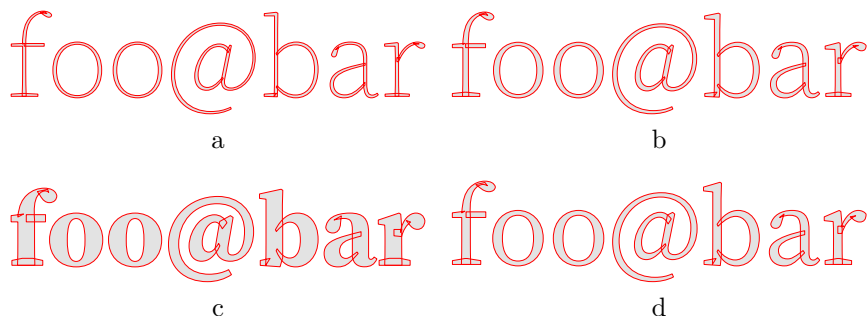
Figure 1 Four variants

to pay. Of course this is not unique for variable fonts, although, in practice, static fonts behave better. To some extent, we're back to where we were with METAFONT and (for instance) Computer Modern: because these originate in bitmaps (and probably use similar design logic) we also can have overlap and bits and pieces pasted together and no one will notice that. The first outline variants of Computer Modern also had such artifacts, while in the static Latin Modern successors, outlines were cleaned up.