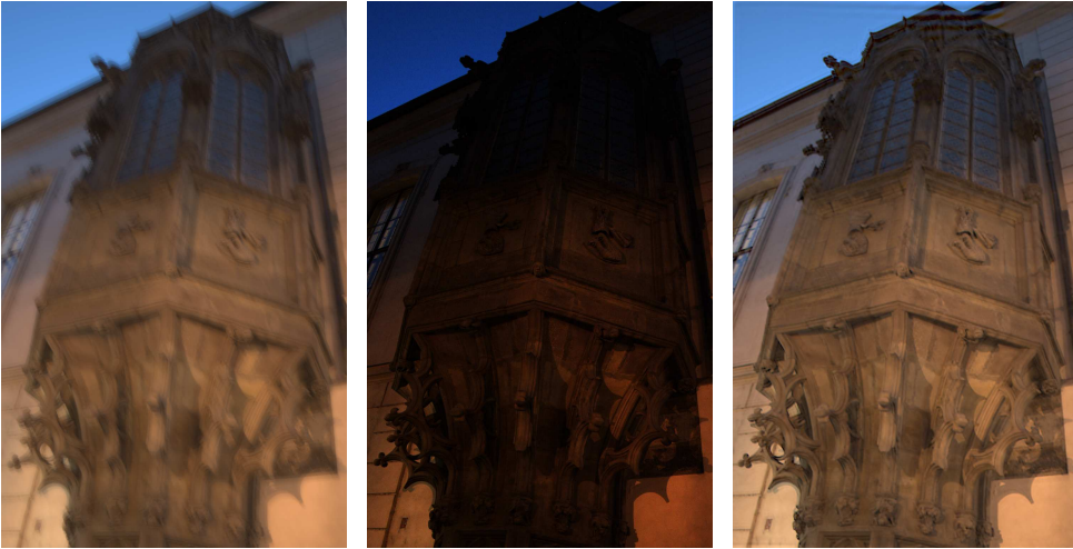
Fig. 3. A night photo ( 1550 \times 980 pixels) taken from hand with shutter speed 2.5s (left). The same photo was taken once more at ISO 1600 with 2 stops under-exposure to achieve a hand-holdable shutter time 1/30s (middle). The right image shows the result of algorithm [23] that fuses the information from both. Best viewed electronically.

In principle, in this case, known blind deconvolution methods such as [17] could be applied locally and the results could be fused. Unfortunately, it is not easy to put the patches together without artifacts on the seams, not mentioning time complexity. An alternative way is to use first the estimated PSF's to approximate the spatially varying PSF by interpolation of adjacent kernels and then compute the image of a better quality by the minimization of the functional (5). The main problem of these procedures is that they are relatively slow, especially if applied on too many positions. We investigated the latter idea for the purpose of image stabilization in [23] using a special setup that simplifies the involved computations and makes them more stable.