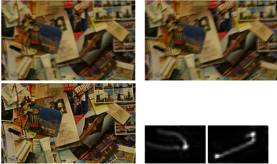
Fig. 1. Multichannel blind deconvolution of a scene degraded by space-invariant blurs: The two photos ( 1800 \times 1080 pixels) on the top acquired by a common digital camera are blurred due to camera shake. The bottom left image shows the estimated sharp image from the two blurry ones using the blind deconvolution algorithm. The bottom right image shows the estimated PSF's ( 50 \times 30 pixels). Best viewed electronically.

much smaller. Then, we upsample the estimated PSF's to the next scale and use them as initial values for the deconvolution on this scale. This procedure repeats until we reach the scale of the original input images.