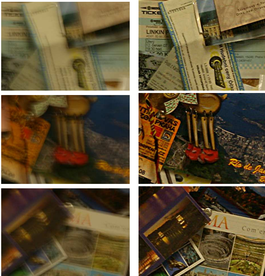
Fig. 2. Close-ups of images in Figure 1: The left column shows three different details of the first input image and the right column shows the corresponding sections in the estimated output image. Best viewed electronically.