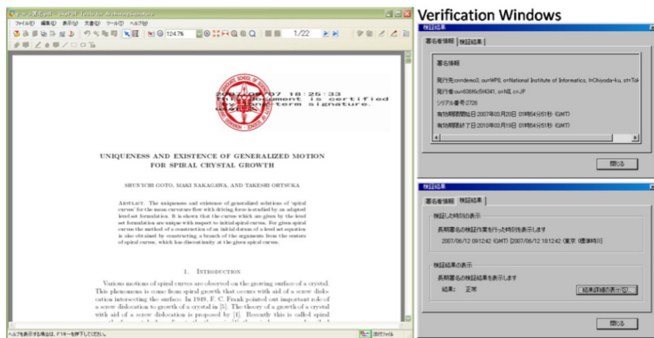
Fig.3. Example of preprint PDF file guaranteed by long-term signature and its verification results

An example of an article PDF secured by a long-term signature is shown in Figure 3. The emblem of the Hokkaido University and minimum information for the long-term signature are superimposed on the article. The position, size, and form of this information can be customized by the client application. The long-term signature can be verified, as shown on the right of the Figure 3.